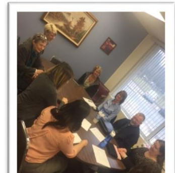
Ford County Network Panel at their monthly meeting. The Panel is a volunteer community and social service network, addressing areas of concern in the county.